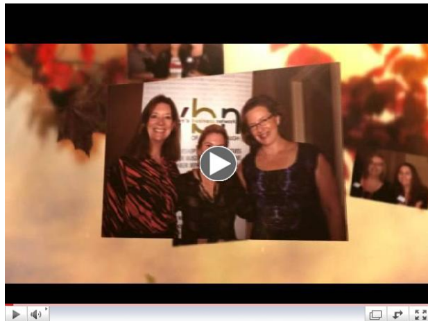
Women's Business Network October 2014

This video captures a few great WBN moments: